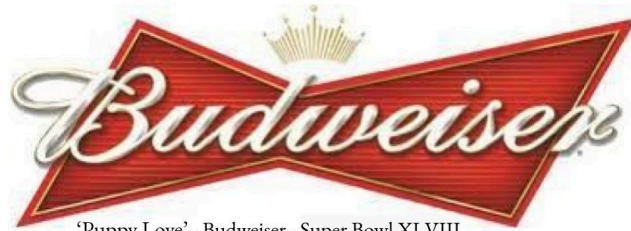
'Puppy Love' - Budweiser - Super Bowl XLVIII

In fifty words or less create an emotional atmosphere surrounding the product/service you want to promote. _____